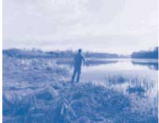
Angling on the System.

With good numbers of salmon in the Lough Neagh system, large numbers of angling tourists will be attracted to the area. The inflow and outflow rivers associated with the Lough Neagh system are reasonably well developed in terms of providing an accessible angling product, although more could be done to improve the quality of the infrastructure for local people and to increase its capacity to attract high spending visitors. In consultation and with full agreement of the fishery owner, the Lough could be explored regarding its potential to be developed for shore or boat based angling. Activities on similar systems could be explored to highlight best practice that could be extrapolated to the Neagh system.