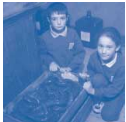
Local children learning about eels at the Lough Neagh Discovery Centre

In order for people to value, respect and influence the management and sustainable development of their area it is important they have a degree of knowledge and appreciation of environmental, economic and social factors. To date, wide knowledge and appreciation of the Wetlands has been confined to a relatively small number of people. This is regrettable given the present internationally renowned resource and the future potential that exists. There are numerous opportunities to educate local people and visitors at facilities such as the Lough Neagh Discovery Centre, Peatlands Park and Portmore Lough. There is also a great opportunity