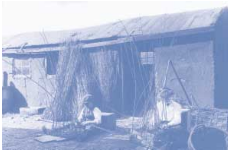
Basket Weaving on the Shores of Lough Neagh.

maintaining and enhancing the facilities available to them. Housing, local schools, youth facilities, health care, meeting places, child care, transport, shops, pubs, recreational opportunities etc. are all vital to maintaining a mixed age ratio and vibrant population. The new deprivation statistics show that some of the highest deprived areas west of the Bann are still found on the western shores of Lough Neagh but, in general, living conditions and opportunities have greatly improved over the last few years. There must be provision for improving the service infrastructure around the Wetlands and there must be opportunities for necessary developments within an overall developmental framework to further alleviate any disadvantage. There are many ways of sympathetically incorporating the necessary physical improvements, including new housing provision into the existing/traditional built and natural landscape. The majority of this service infrastructure is contained within individual area plans and it is therefore vital that local inhabitants and stakeholders know how to influence the local planning process. Statutory/residents/stakeholder partnerships should be set up to ensure that local people can and have a meaningful input into all processes that impact on their area.